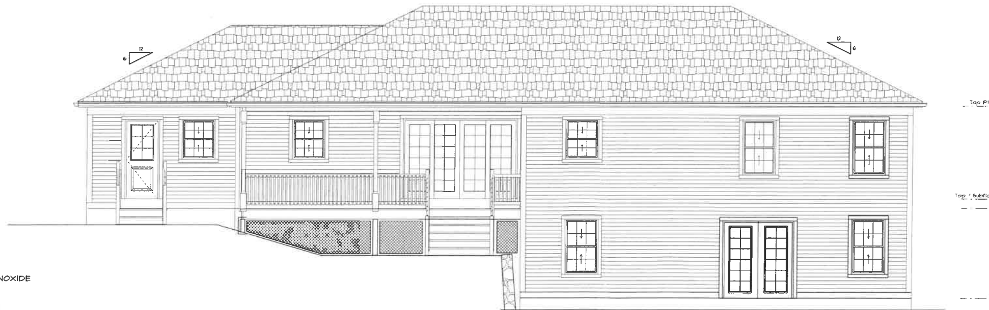
BACK ELEVATION 1/4"=1'-0"