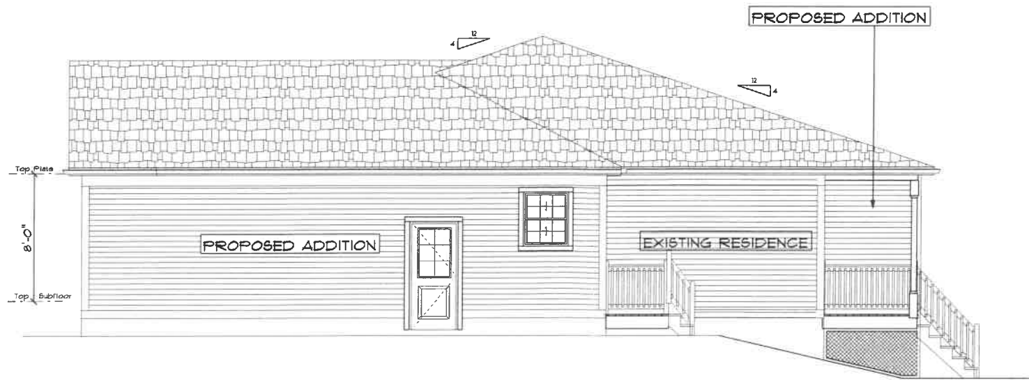
RIGHT SIDE ELEVATION 1/4"=1'-0"