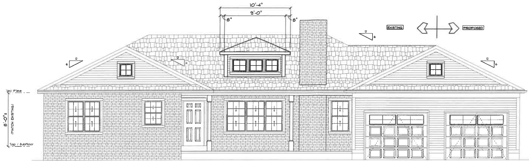
FRONT ELEVATION 1/4"=1'-0"