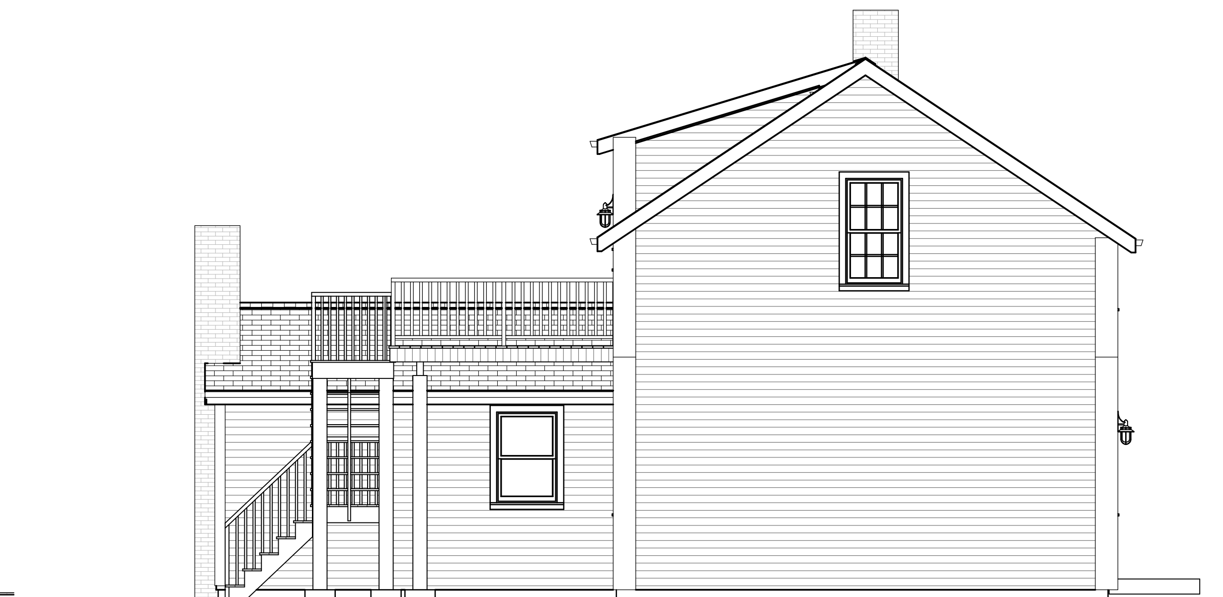
North Elevation Scale 1/4" = 1'