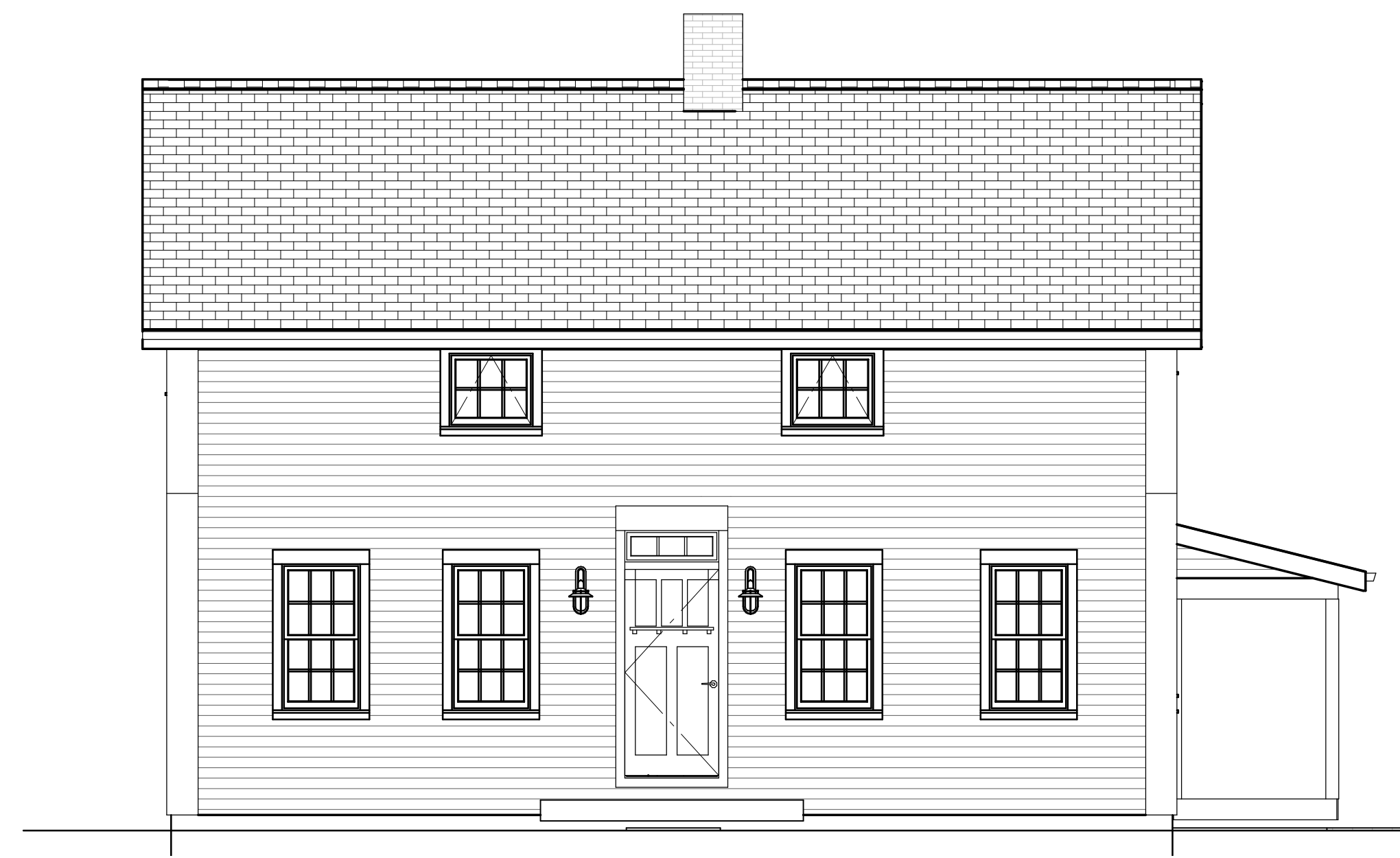
West Elevation Scale 1/4" = 1'