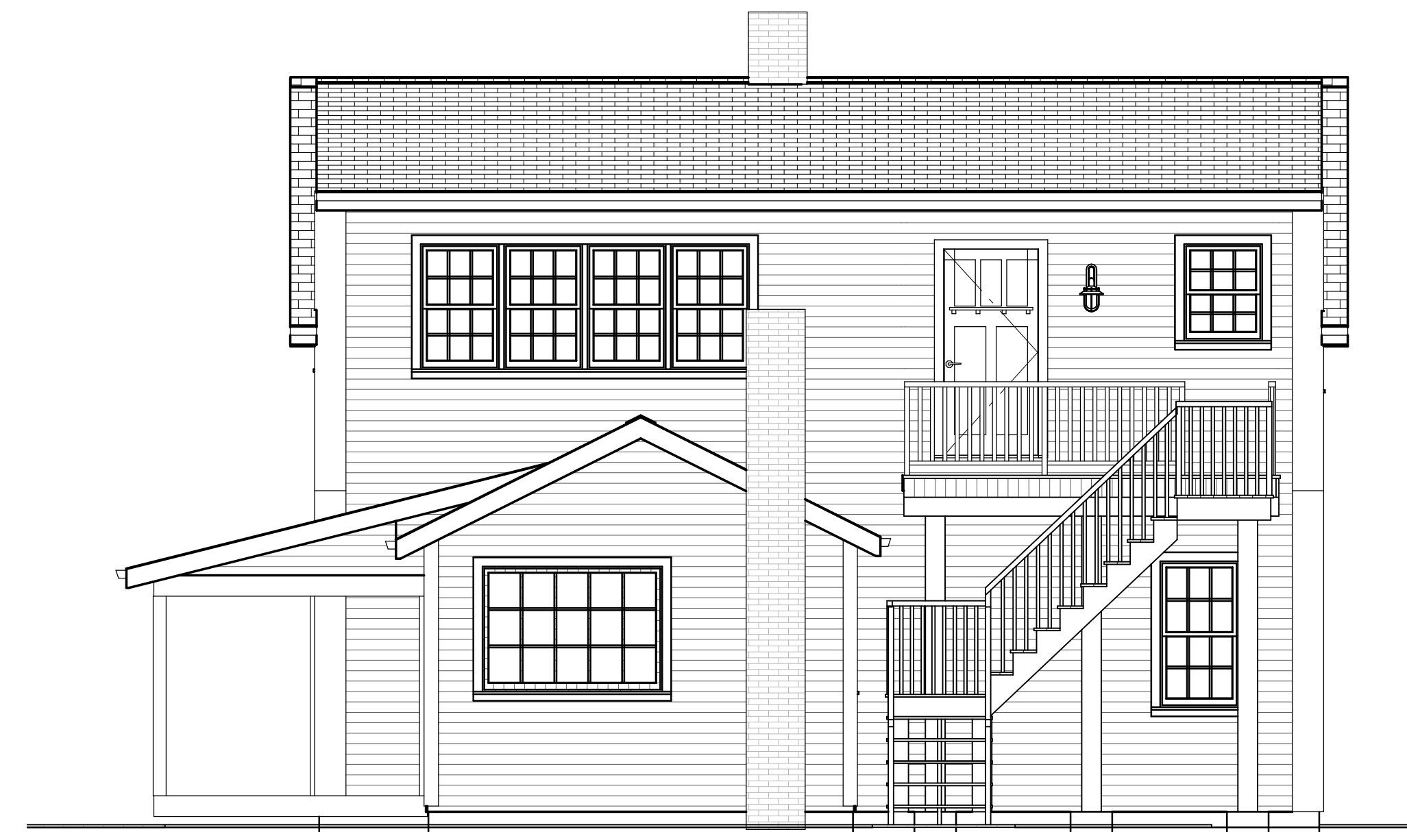
East Elevation Scale 1/4" = 1'