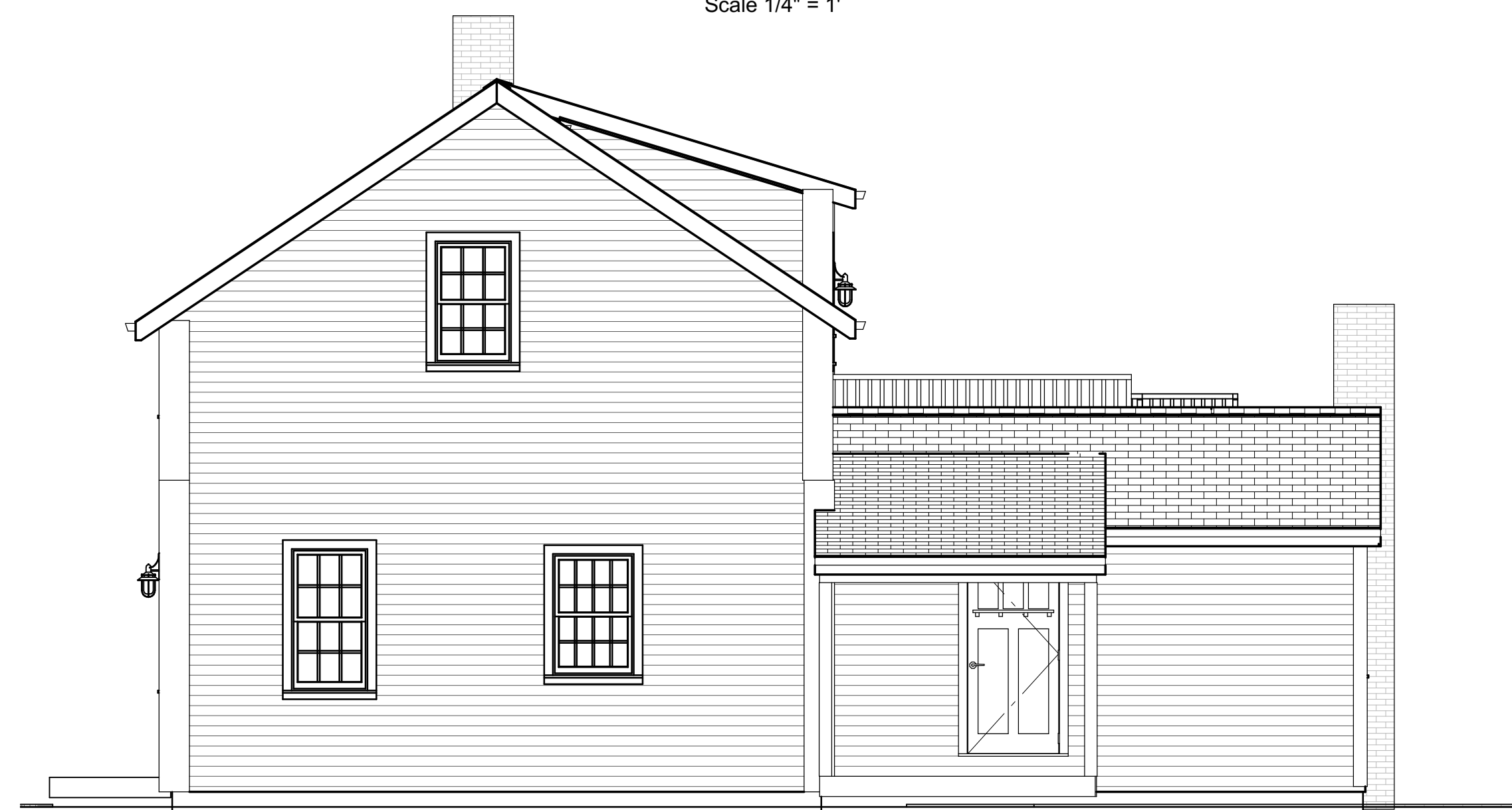
South Elevation Scale 1/4" = 1'